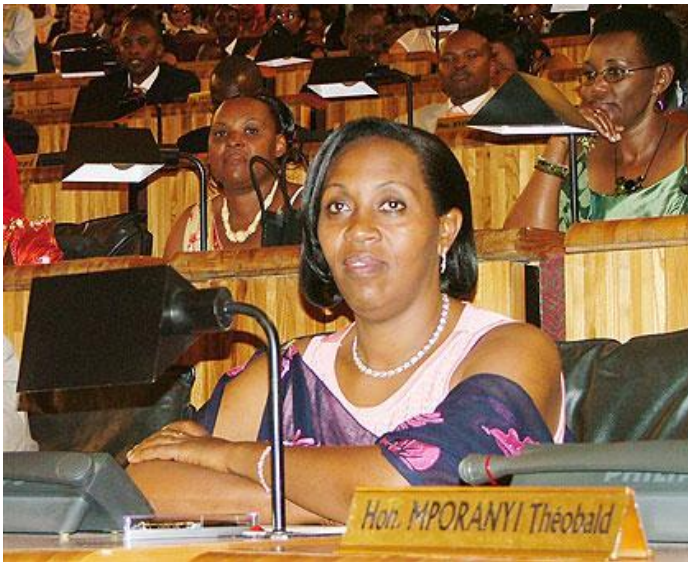
Women MPs in the Rwandan Parliament, 2012